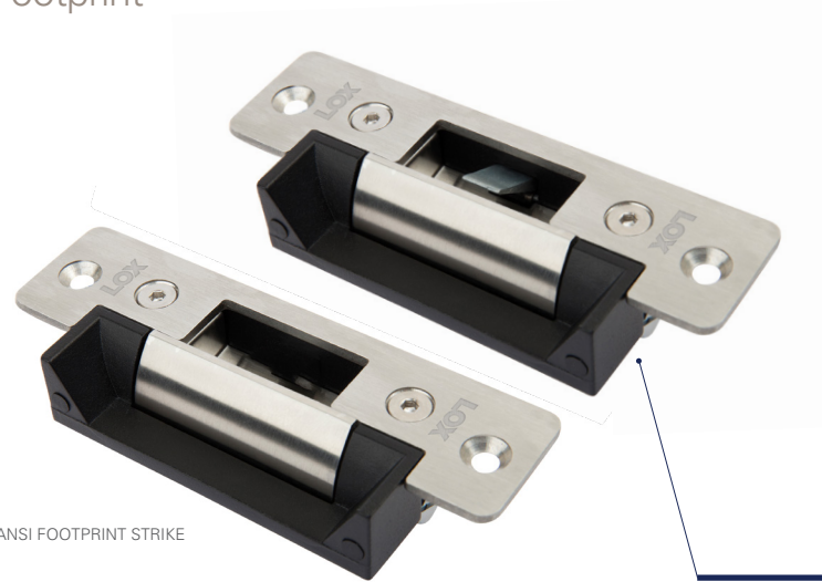
ES10 NON MONITORED ANSI FOOTPRINT STRIKE

The non-monitored ES10 version is weather resistant IP56 rated.